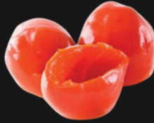
whole sweet peppadews, mild

Roland 6/88.2 oz, #391210 12/28 oz, #391202