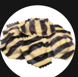
striped lobster ravioli