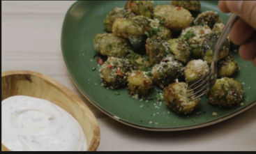
BRUSS'LZ BATTERED APPETIZER #801644, 4/3 LB