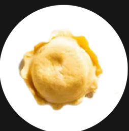
butternut squash ravioli