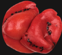
fire roasted red peppers

Roland 6/88.2 oz, #391210 12/28 oz, #391202