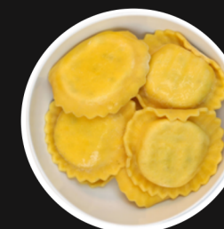
large cheese ravioli