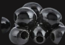
olives black pitted