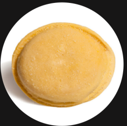
jumbo cheese ravioli