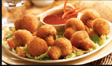
BREADED MUSHROOM #801602, 6/2.5 LB