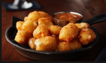
BREADED CHEDDAR CHEESE CURDS #801638, 2/5 LB