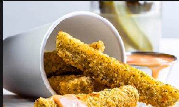
BREADED DILL PICKLE SPEARS #801614, 4/4 LB