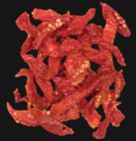
sundried tomato strips