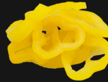
banana ring peppers