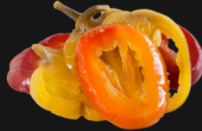
hot cherry peppers sliced