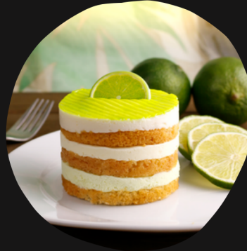
Key west Key lime