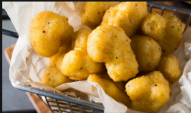
BATTERED CAULIFLOWER #801502, 6/48 OZ