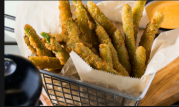
TOASTED GREEN BEANS #994996, 6/2 LB