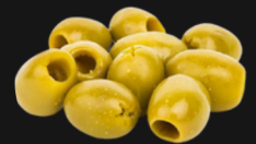
olives green pitted