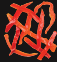
roasted red pepper strips