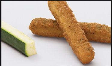
BREADED ZUCCHINI STICKS #861010, 6/2 LB