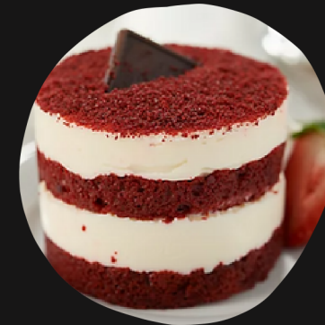
lil red velvet