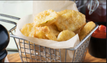
TEMPURA BATTERED PICKLE CHIPS #700287, 4/2 LB