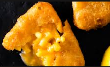
MAC & CHEESE WEDGES #801601, 6/3 LB