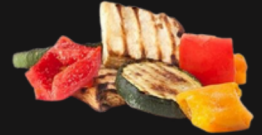
grilled mixed vegetables