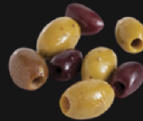
country pitted olives