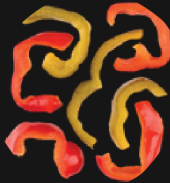
red & green sweet pepper strips