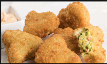
BREADED BROCCOLI CHEDDAR BITES #801603, 6/2.5 LB