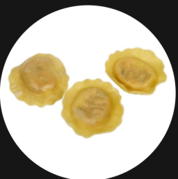
maine lobster ravioli